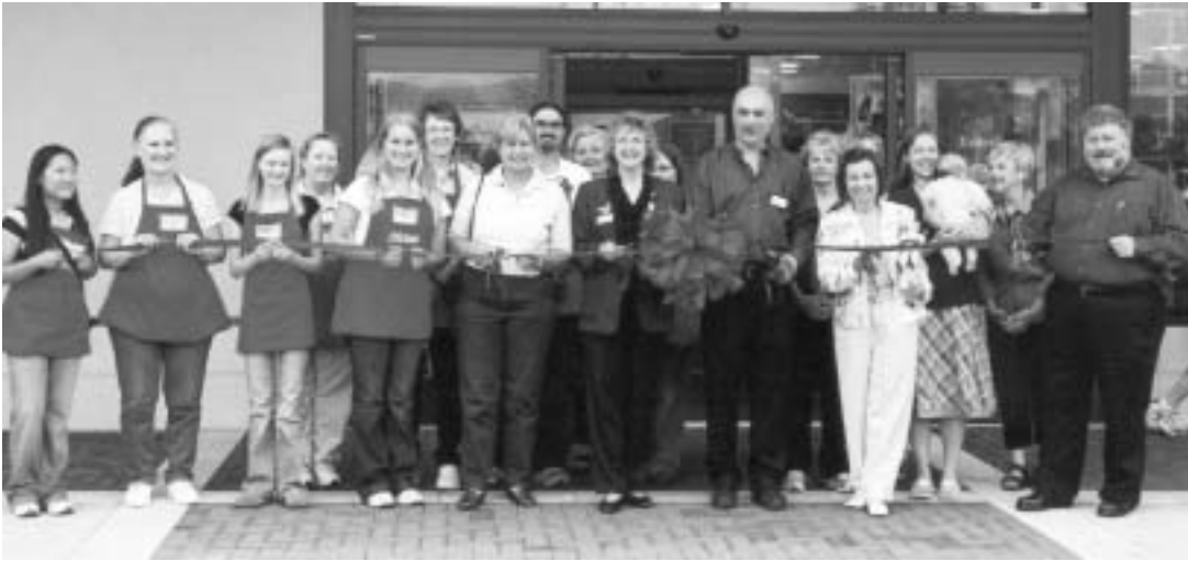
Michael's celebrates its new location in Olathe Pointe, 14685 W. 119th St. with a ribbon cutting.