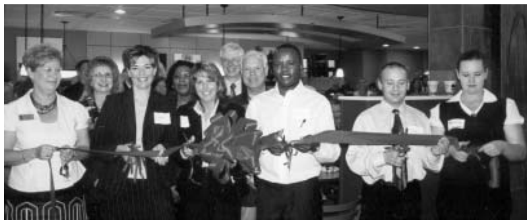
MacDonald's celebrated the grand re-opening of its remodeled restaurant on Hamilton Circle.