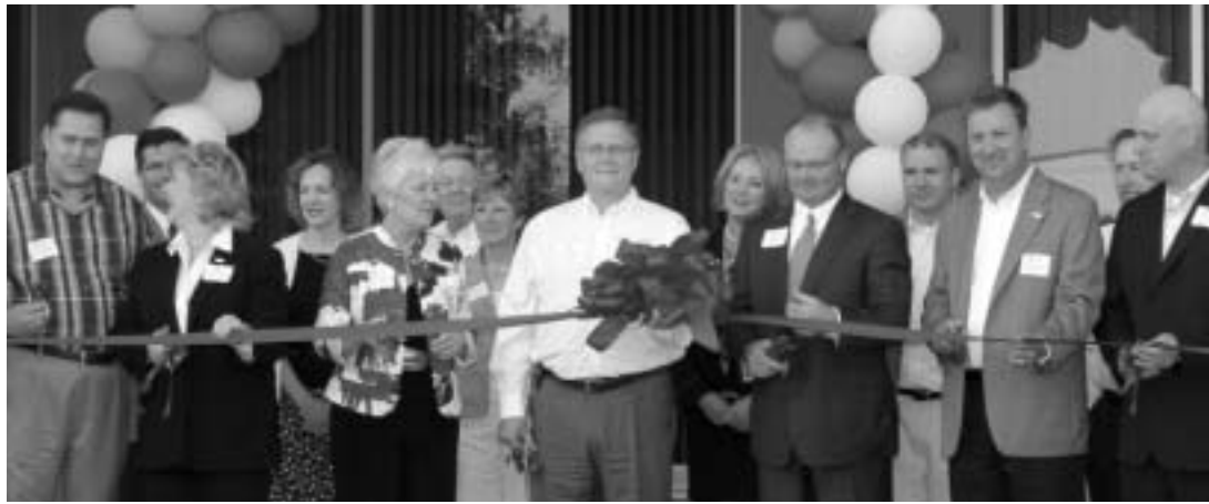
Farmers Insurance Group, the largest private employer in Olathe with an employee count approaching 3,000, cuts a ribbon at its I-35/Renner Industrial Park Service Point location.