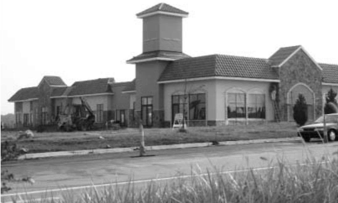
College Point developers are putting the final touches on retail facilities in its multi-use development on College Boulevard, just west of K-10 in northwest Olathe.

The Olathe News will launch a new newspaper, the Lenexa Centennial on Aug. 2. Lenexa, which has 50,000 residents, is celebrating its centennial this year, and hence the new publication's moniker. The Centennial will be distributed through the mail. The Olathe News is a McClatchy-owned suburban Kansas City newspaper.