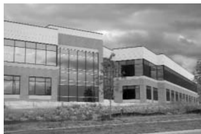
Two new buildings—which will house Terracon and a Garmin division (above, top) and Farmers (above)—will be complete before the end of the year.

the Chamber’s executive vice president of Economic Development.