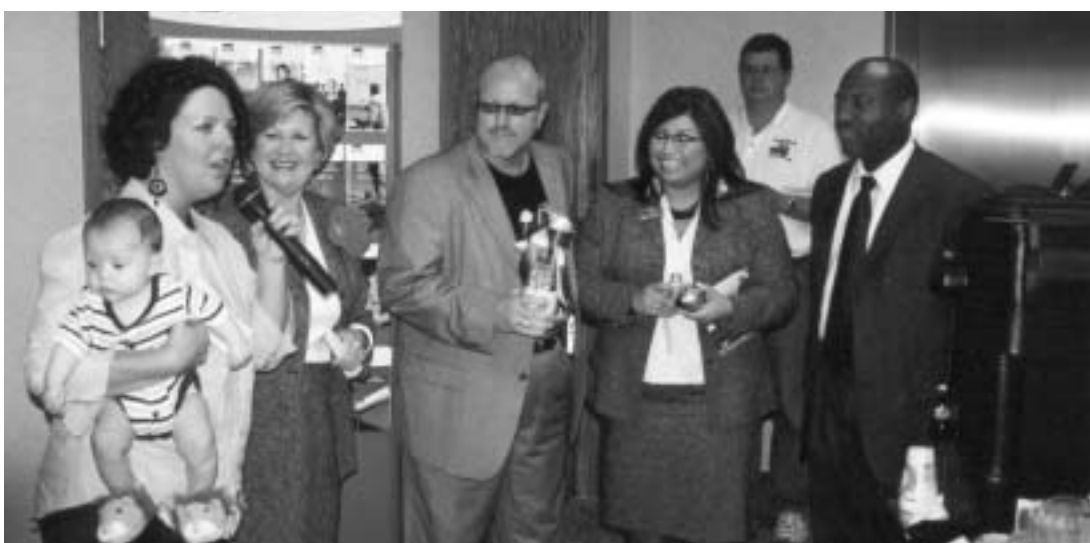
M&I Bank recently hosted a Chamber coffee at its Olathe Station location.

In its ongoing effort to secure feedback from members, the Chamber is undertaking a communications survey. The surveys will be e-mailed to members this month and are being sent in INFO-Exchange.