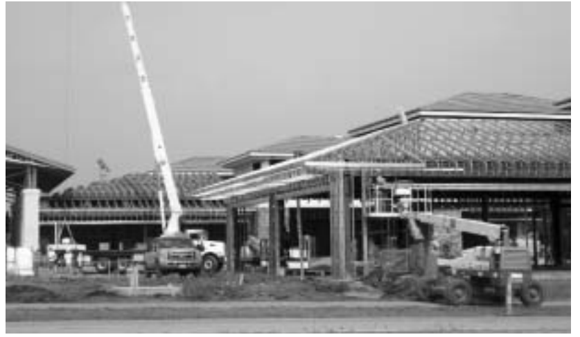
Prairie Trails West Shopping Center, 151st and Black Bob, is changing the landscape in southeast Olathe.

The festivities will take place in the new car showroom with refreshments at 5:30 p.m. and dinner at 6 p.m. The program, with door prizes, will be at 6:15 p.m. View new 2008 Fords, the Taurus and the Edge, an exhibit by the Kansas Highway Patrol, and more. RSVP at www.olathe.org or call (913) 764-1050. Donations will be accepted for TLC for Children and Families.